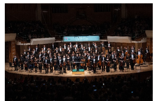
Hong Kong Philharmonic Orchestra