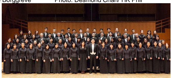
The Learners Chorus