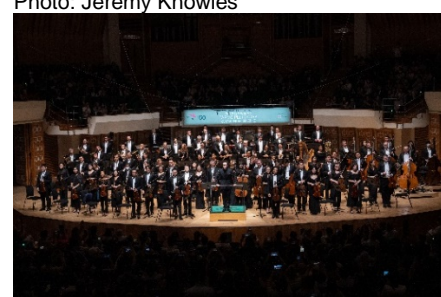
Hong Kong Philharmonic Orchestra